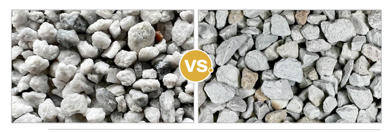
Photos of swimming pool filtration grade (#7) pumice (left) and zeolite. Zeolites' strengths lie at the molecular level—the ability to work as a molecular sieve.

Clinoptilolite Zeolites have application in the agriculture sector in animal feeds, waste odor control, composting, filtration, and soil amendments. Zeolites share a key characteristic with pumice—they do not need calcination to achieve functional form. Much of the functional value in zeolites is found at the molecular level rather than the physical form factor, although an extensive per-particle surface area, absorptive character and other physical characteristics also contribute in certain applications.