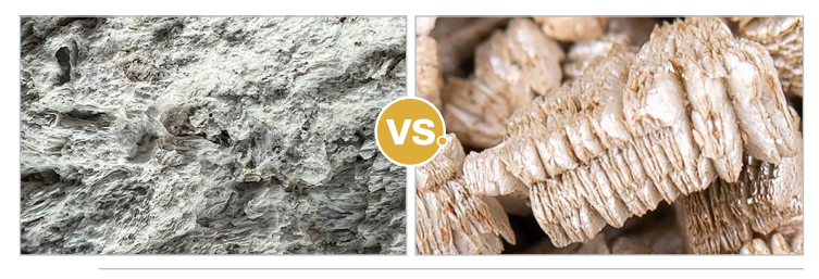
The hard, vesicular texture of pumice (left) compared to the softer, scaly, worm-like segmented structure of exfoliated vermiculite.

Similar to the perlite expansion process, finished vermiculite is the product of heat-expanding vermiculite ore (a hydrous phyllosilicate mineral; member of the mica family). Known for its horticultural applications, exfoliated vermiculite also has industrial and construction applications. It is quite soft and crumbly, rating a 1.5 to 2 on the Mohs hardness scale.